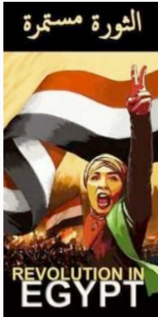
poster of the 1st International Women's Day on Tahrir Square March, 8th 2011