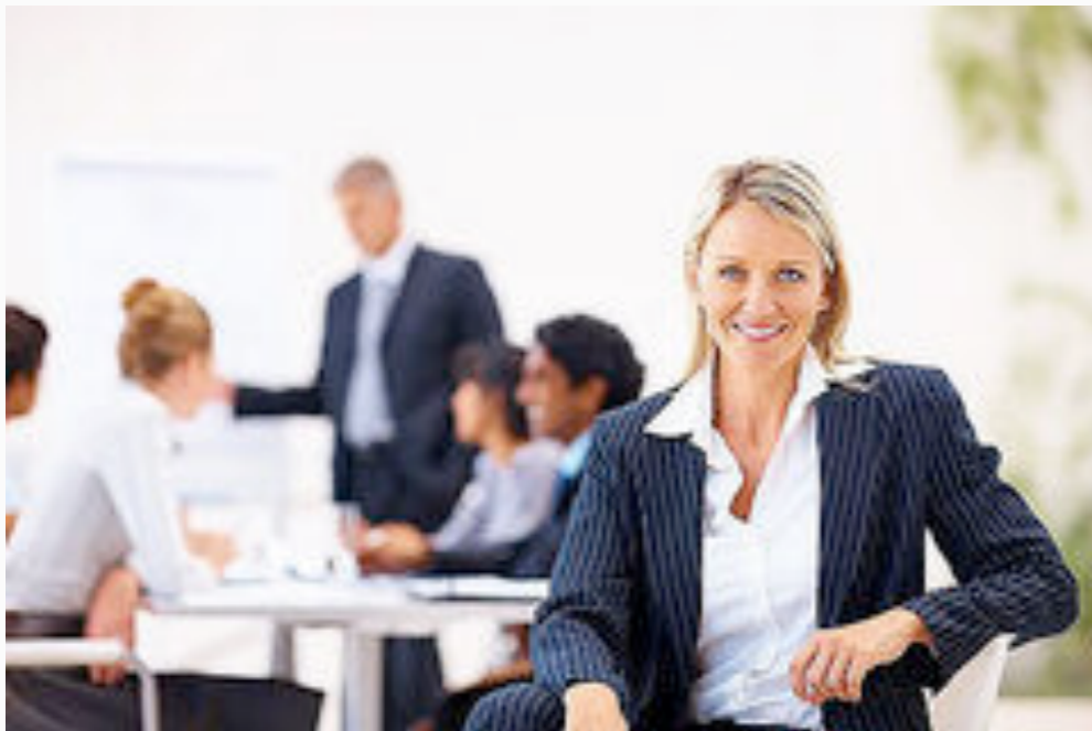
Website German Bundestag

... the decree of the » German Bundestag« for a female quota in higher positions